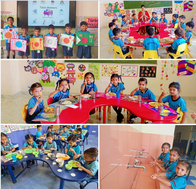
Table Manners Activity

On July 23, a Table Manners Activity was conducted at the school premises for the pre-primary wing. Children learned table setting, use of utensils, and polite dining habits. They practiced saying “please” and “thank you” while eating. The activity helped them learn important social etiquette.